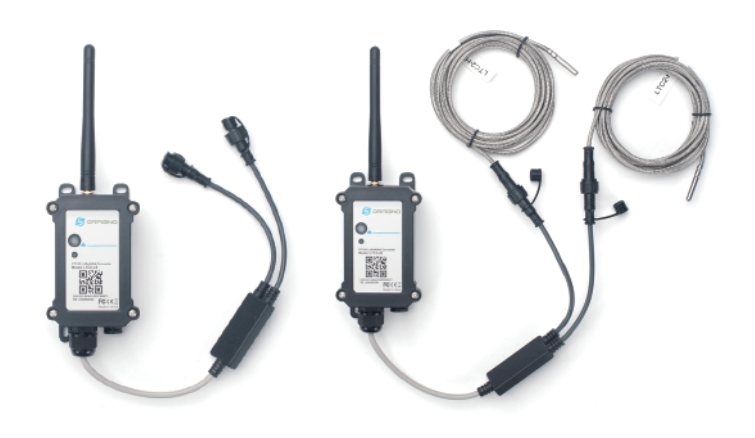
Model LTC2 series doesn't include probes. Probes are purchased seperately

The Dragino LTC2 series is powered by 8500mAh Li-SOCI2 battery or solar panel with Li-ion battery, it is designed for long-term use up to several years.