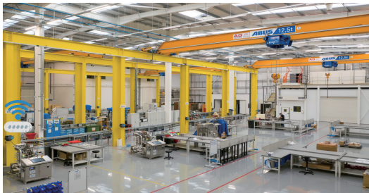
Factory Wireless Control