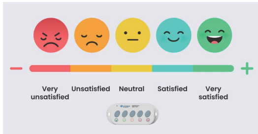
User satisfaction rating