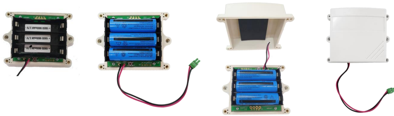
Fig. Rechargeable Lithium Battery

3. RA0716Y is waterproof and can be placed outdoors after the device completes joining the network..