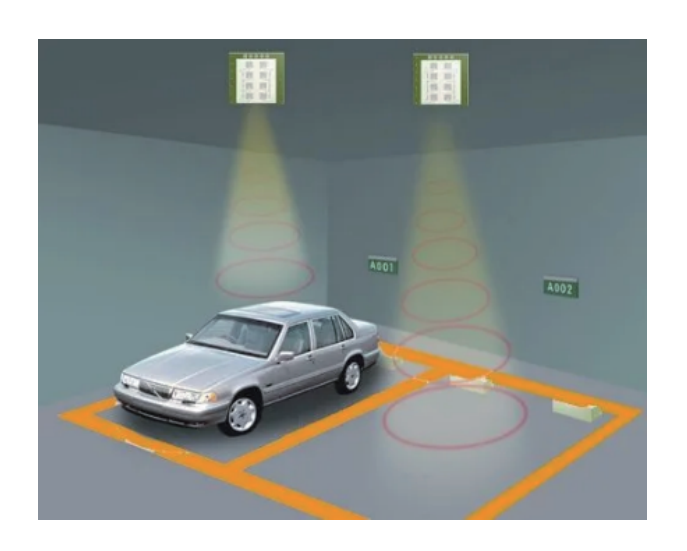
Parking Radar Ranging