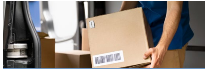
TRAVEL & LUGGAGE

Track multi-user resources—like projectors, tools, or safety equipment—to see who has them, where they are in use, and receive alerts if they’re taken beyond authorized boundaries.