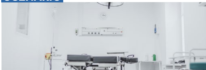
HOSPITAL ASSET TRACKING

Label medical devices, beds, or patient wristbands with a rechargeable or disposable beacon. Real-time location data minimizes the risk of equipment misplacement and ensures timely patient care.