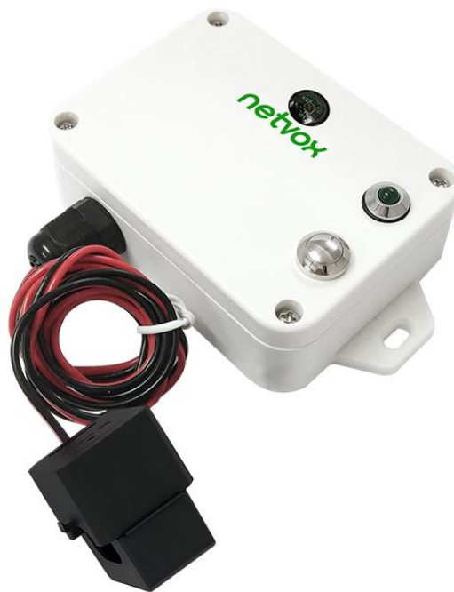
Figure1 R718NL115 (Subject to the object)

Wireless Sensor Network Based on LoRa Technology