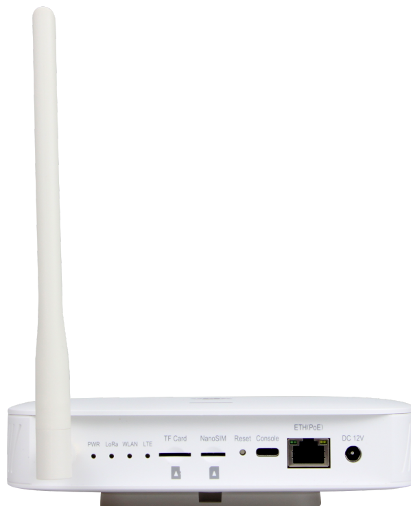
Figure 2: WisGate Edge Lite 2 Interfaces

The hardware interfaces of RAK7268 gateway include DC 12 V, ETH interface, Console interface, Reset key, TF Card slot, Status indicator LEDs, LoRa Antenna connector, etc.