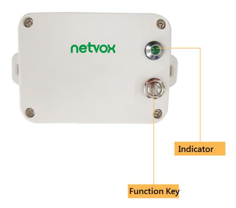
Fig.1 R718MA Appearance